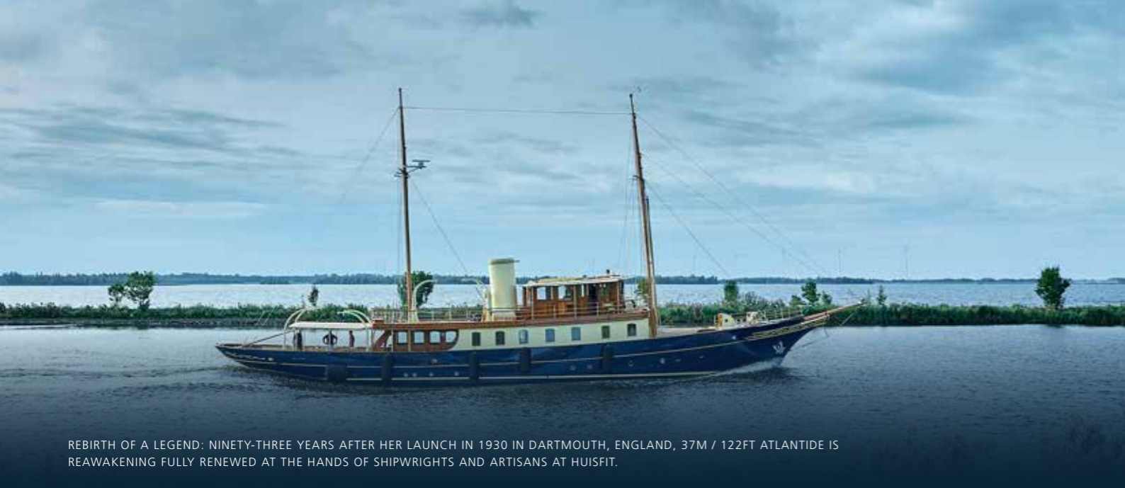
REBIRTH OF A LEGEND: NINETY-THREE YEARS AFTER HER LAUNCH IN 1930 IN DARTMOUTH, ENGLAND, 37M / 122FT ATLANTIDE IS REAWAKENING FULLY RENEWED AT THE HANDS OF SHIPWRIGHTS AND ARTISANS AT HUISFIT.

"Huisfit is leading the way by retrofitting older yachts like Foftein, first delivered in 1999, and Juliet, first delivered in 1993. Juliet had a hybrid engine fitted to reduce her emissions."